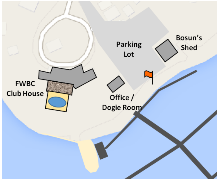
Figure 1 – FWBC Facility Layout