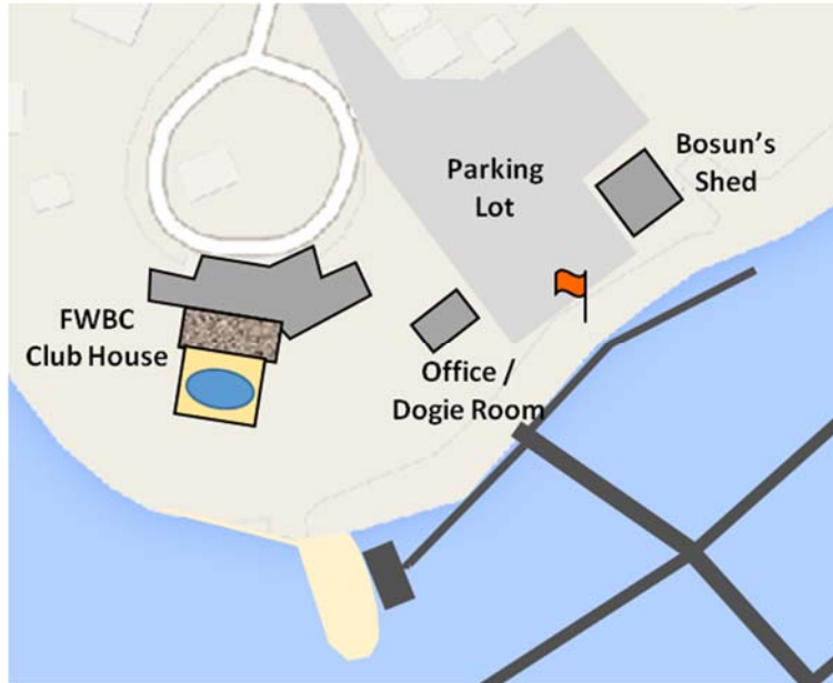
Figure 1 – FWBC Facility Layout